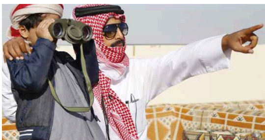
A Qatari boy being guided to watch a flying falcon.