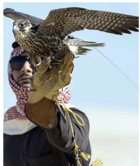
A participant prepares to release his falcon.