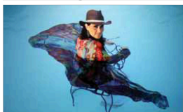
Katara opens 'Fish Out of Water' photo gallery