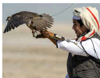
A young competitor releases a falcon at the festival.